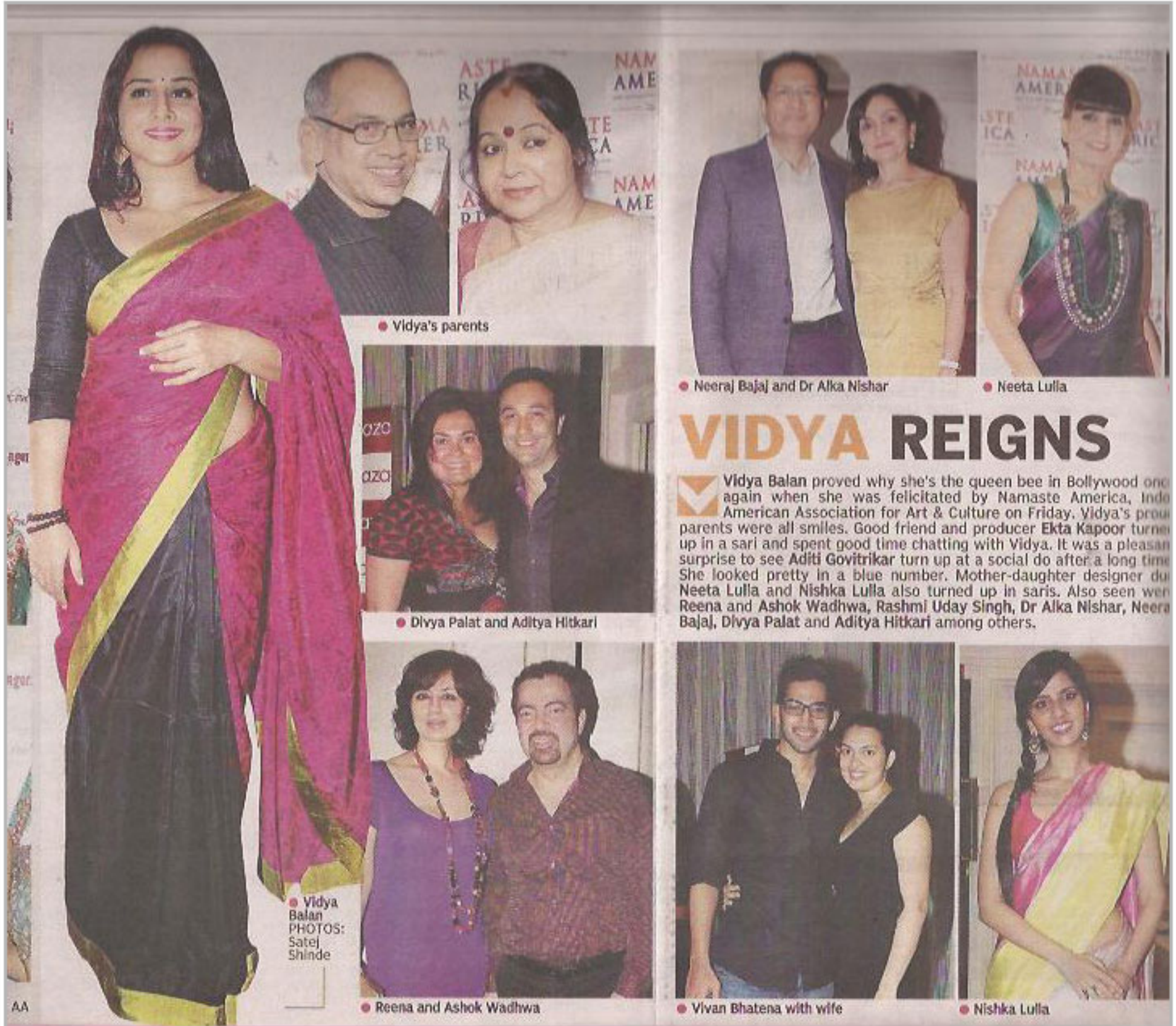
● Vidya's parents