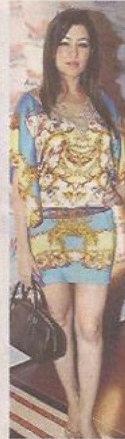
KEEPIN' IT SHORT: Aditi Govitrikar