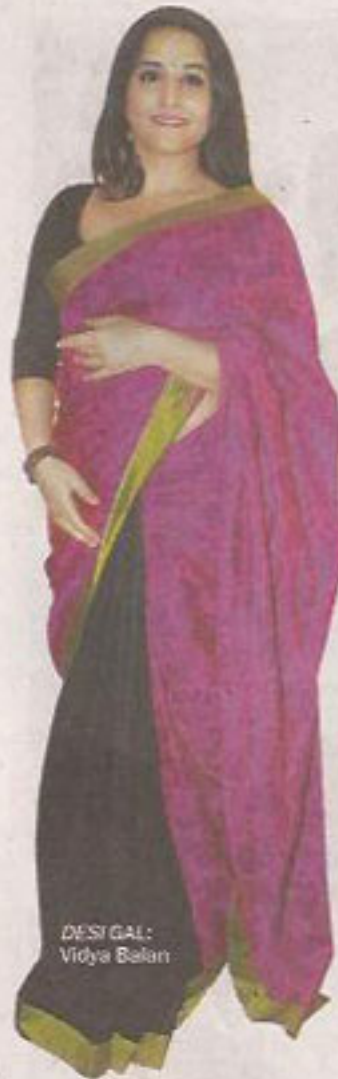
DESIGAL: Vidya Balan