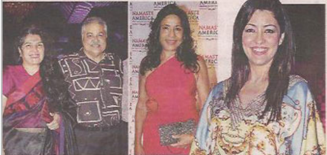
ish Shah with wife