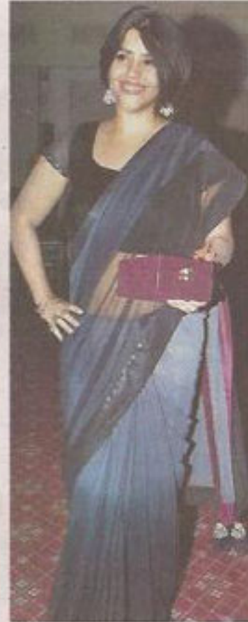
FEELING DEMURE: Ekta Kapoor