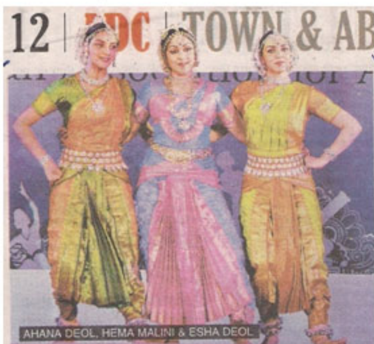
AHANA DEOL, HEMA MALINI & ESHA DEOL