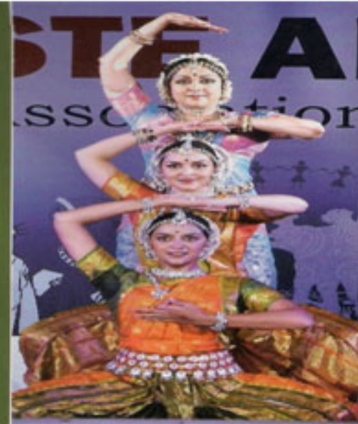
Hema Malini with daughters Esha & Ahana Deol