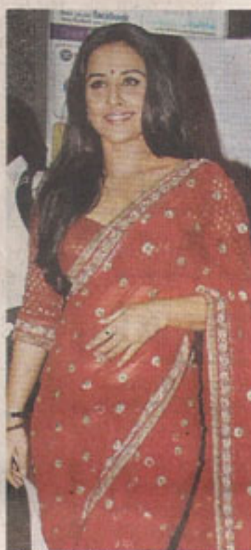
CULTURE QUEST: Vidya Balan will inaugurate the show