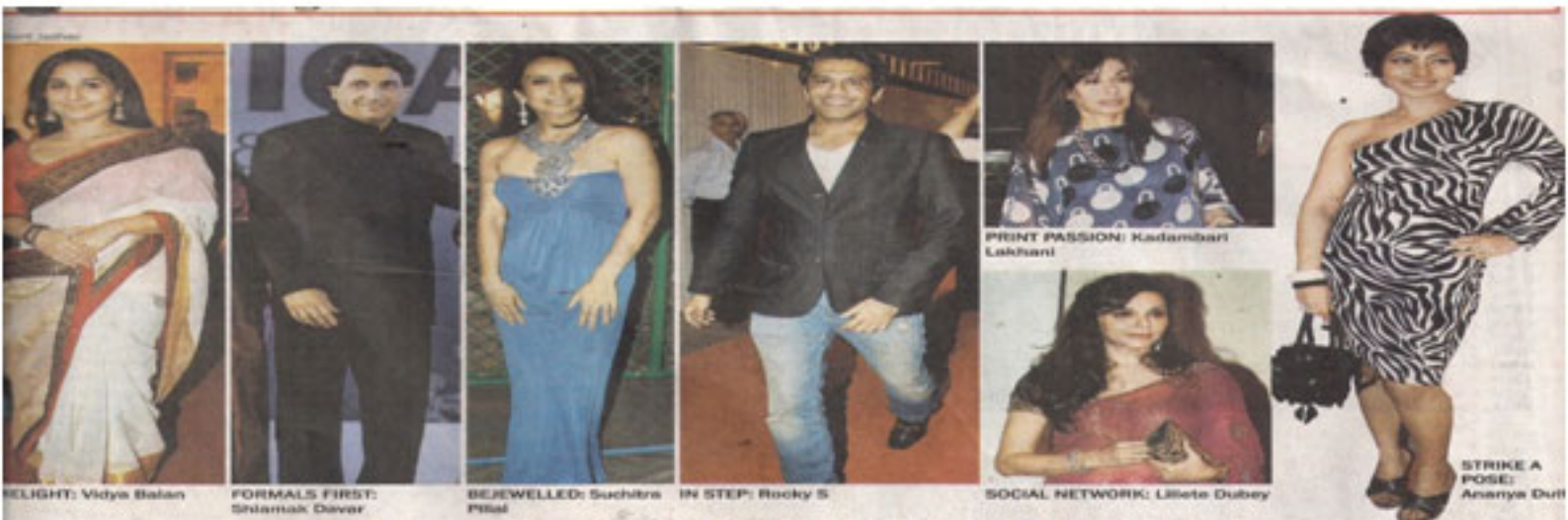
DELIGHT: Vidya Balan